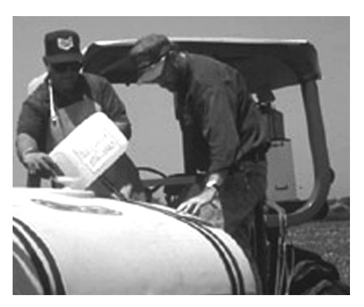
A noncertified applicator must be supervised during mixing and loading of restricted-use pesticides.

Making a pesticide application for payment (using restricted-use products or not) requires commercial Category 1a (ag plant pest control) certification, a business license, and proof of insurance. For more information on obtaining a business license, go to the pesticide section of the OISC Website, <a href="http://www.isco.purdue.edu/index_pest.html">http://www.isco.purdue.edu/index_pest.html</a>; or call 765/494-1594.