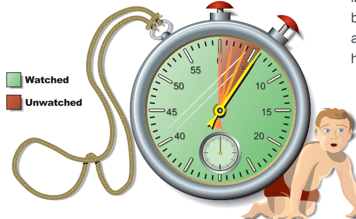
Poisonings Can Take Only Seconds... Do you know where your child is every second?

A poisoning can happen so quickly! One minute a mother was watching her toddler playing and laughing, and just minutes later she found him in the kitchen sitting in a puddle of household insecticide.