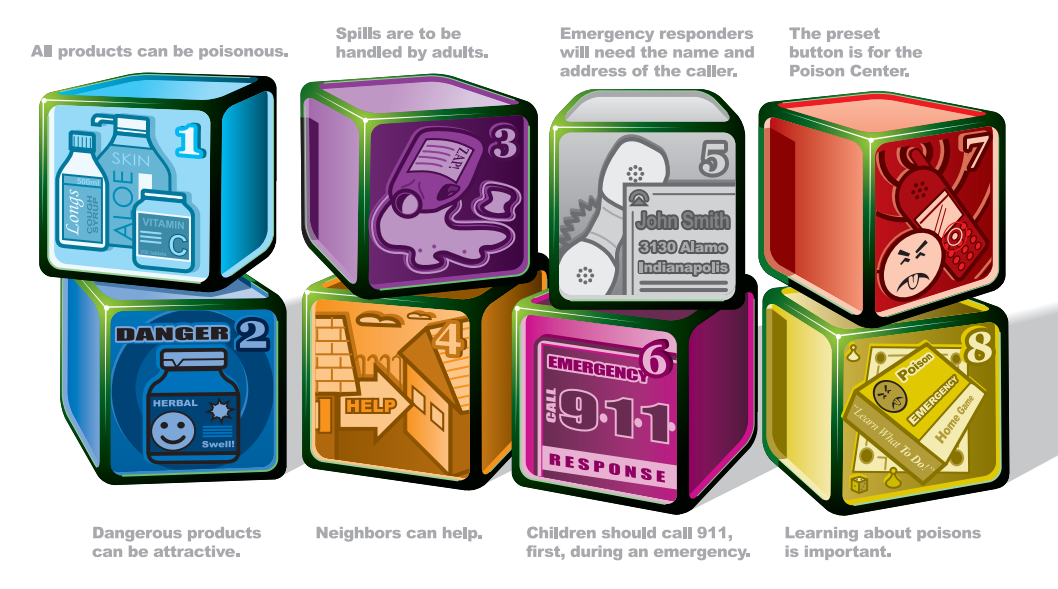
Teach Children About Poisonings and Other Emergencies

Neighbors can help. Teach children to go to a neighbor for help if you are not at home: at the first sign of a fire (smoke or heat), a chemical spill, or any unusual smell; or if an exposure occurs. Establish a safe meeting place where everyone in the family