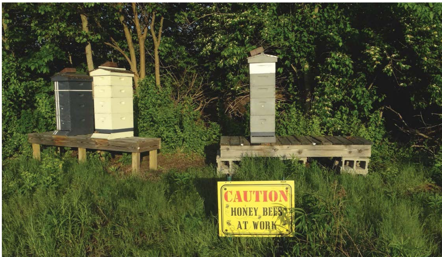
Figure 4. Everyone involved in production agriculture has an interest in protecting pollinators.