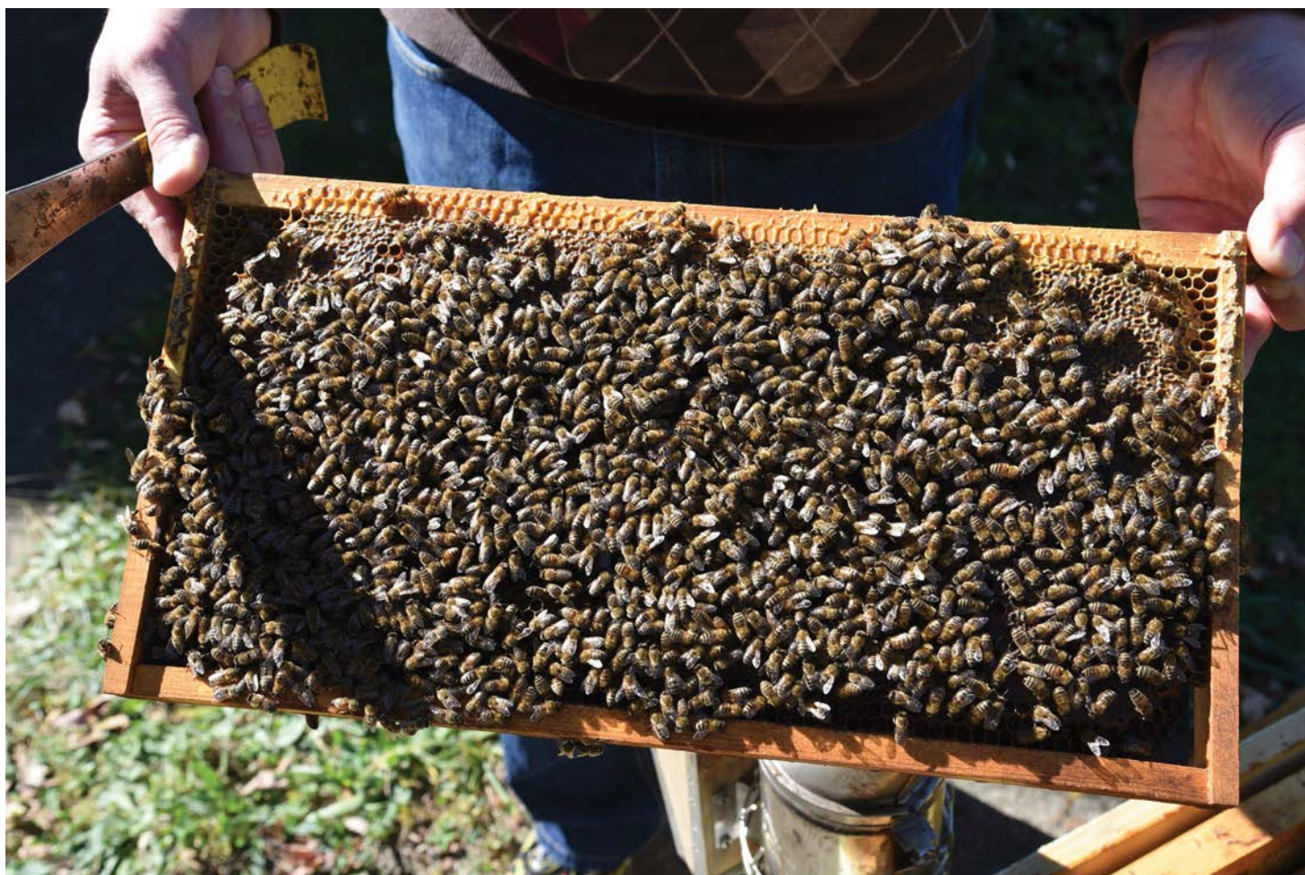
Figure 9. A beekeeper's goal is to manage bees so they remain healthy and productive. An applicator's goal is to safely manage crop pests. These goals can exist at the same time as long as everyone does their part.