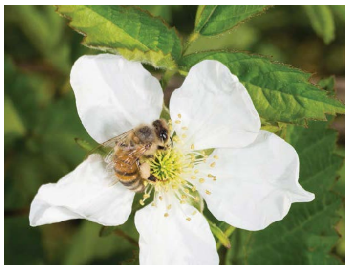
Figure 8. Keep all pesticide applications on the target field — off-site movement can harm nearby pollinators.

There are many misconceptions about the role commercial applicators play in protecting crops and the environment. Be willing to attend programs put on by bee associations, Cooperative Extension Service, Natural Resources Conservation Service, and public libraries. These meetings can give you an opportunity to explain the role in protecting crops and the steps you take to reduce the risks to nontarget insects, plants, and wildlife. Being willing to speak can provide important facts that may be missing from general discussions on pesticides and pollinators.