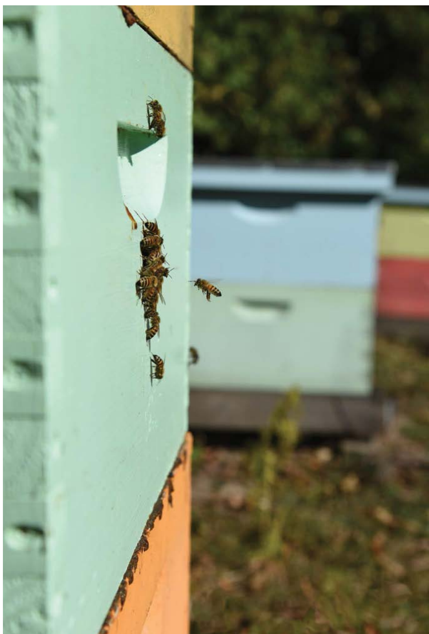
Figure 5. Commercial applicators must protect both crops and pollinators.

If a pesticide product can harm pollinators, the U.S. Environmental Protection Agency (EPA) requires the pesticide label to carry warning statements. The warning also directs applicators about actions they must take to protect pollinators.