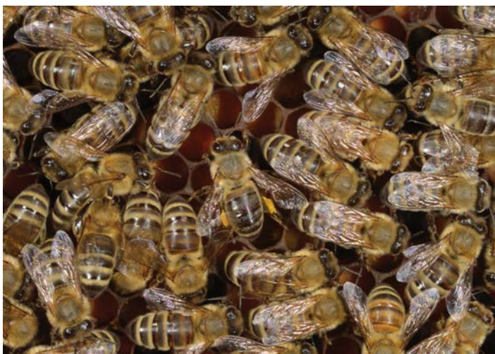
Figure 3. The honey bee in the center of this photo has yellow pollen on its hind legs, which it is bringing back to the hive.

Pesticides are critical for maintaining crop yields and quality. But everyone involved in production agriculture also has a vested interest in protecting pollinators.