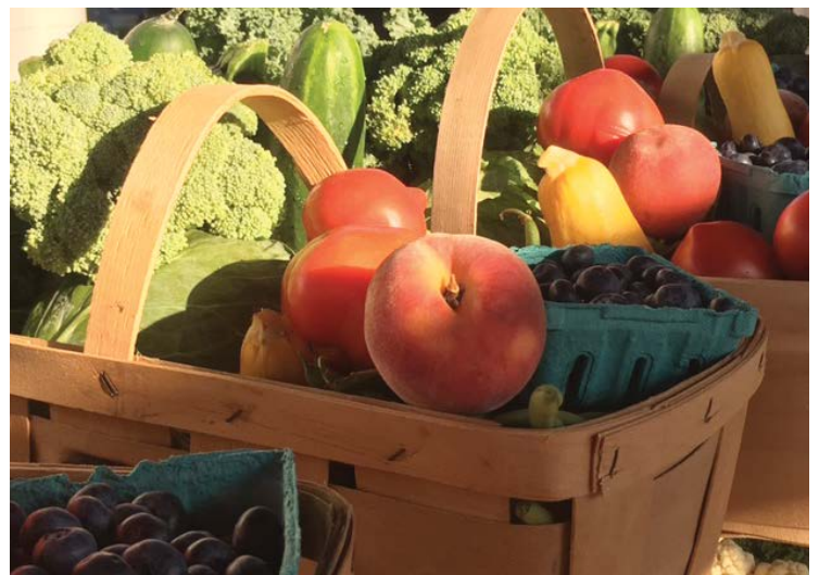
Figure 2. Chances are good that most of the fruit and vegetables you eat every day require pollination. Without the commercial apiary industry and native pollinators, much of what we purchase at the grocery store would be scarce and far more expensive.

Not only are honey bees vital to production agriculture, so are countless native pollinator species. And it doesn't matter if the farm is small or large, organic or traditional, pollinators play a pivotal role in boosting fruit and vegetable crop yields.