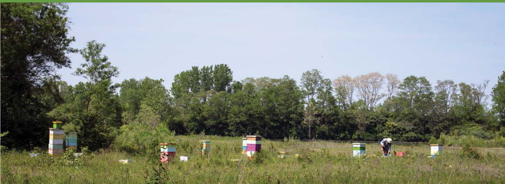
Figure 7. Be aware of your neighbors. Consider using FieldWatch.com to find if there are any beekeepers registered near an area where you will spray.

Consider using FieldWatch.com , a website that can tell you if any beekeepers have registered bee hives in your area. The site covers Indiana and several other states