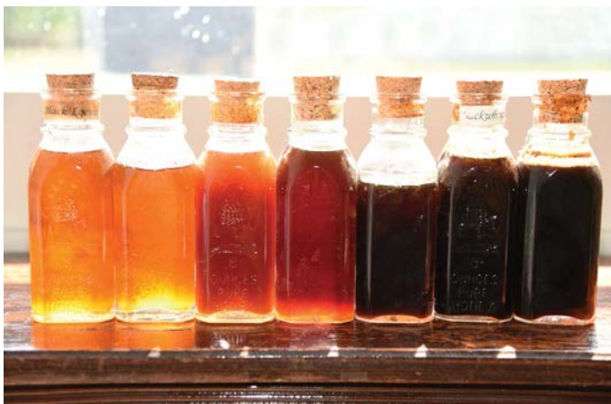
Figure 1. The taste and color of honey depend on the plants the honey bees were foraging on when they made it.

When people think of bees, they often think of honey. Sure, honey is an important agricultural product, but managed honey bees pollinate commercial nut, fruit, and vegetable crops. As you drive across the country during the growing season, you will see bee hives placed in and around diverse fields of crops. It's a critical, multi-billion-dollar industry.