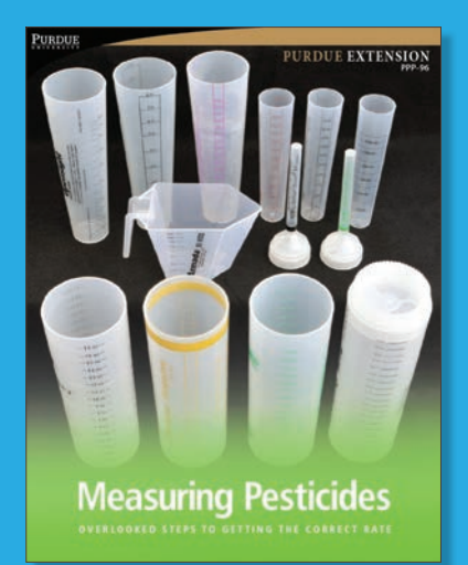
Measuring Pesticides: Overlooked Steps to Getting the Correct Rate (PPP-96). Understand effective measuring techniques that ensure success.